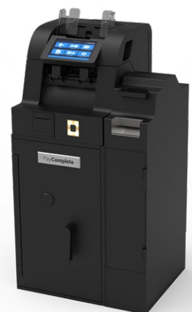
Example of installation, here together with SDS-520