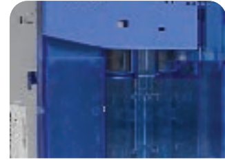
6 TUBES AND 3 INDEPENDENT MOTORS