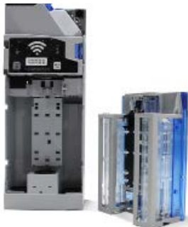
EASY ACCESS TO MOVING PARTS TO HELP MAINTENANCE