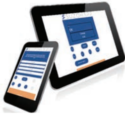
USER-FRIENDLY MENU FOR EASY PROGRAMMING THROUGH SMARTPHONE, TABLET OR LAPTOP