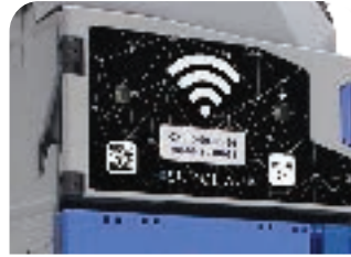
QR-CODE FOR LOCAL WIRELESS CONNECTION