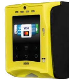
NAYAX VPOS TOUCH READER