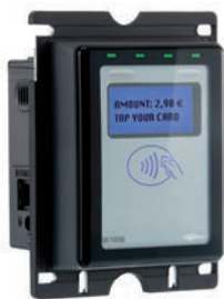
INGENICO CONTACTLESS READER IUC180