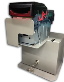
CASH BOX COIN CAPACITY 1,000 PIECES OVERALL BANKNOTE READER WITH 300 BANKNOTE STACKER