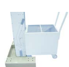
WHEEL RACK SC-96160

Accessory to equip the SC-93365 coin lift with wheels.