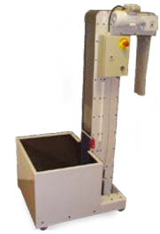
SC-93420 AND SC-93500

prevents coins from falling off and makes transport easy to supervise. For personal safety, the machine stops automatically if the operator tries to grab a coin while the machine is running. The complete unit is equipped with wheels for easy movement and access when servicing.