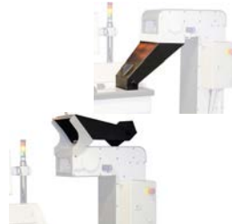
PLASTIC CHUTE SC-98450

Used to connect coin lifts to the ICP Active-9. Allows you to open the ICP Active without moving the coin lift.